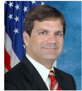
Gus Bilirakis (R-FL) currently serves the Ninth Congressional district of Florida

For more details about the resolutions and letters, please visit our website FAPA.org .