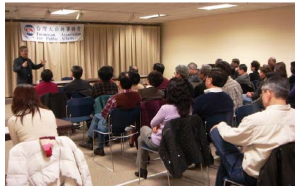
Maryland Chapter Meeting on 2/24/2008